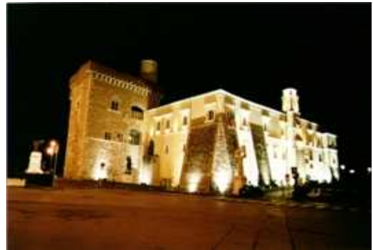
Rocca dei Rettori (night picture)

Built under Pope John XXII in 1321, following the model of the big military structures in Avignone and Carcassone (France), it stands on the dismantled Longobard fortress, erected in its turn over the Roman arch that dominated the road from Benevento to Avellino. The seat of the Papal Rectors is composed of three floors and two lookout towers. Recently restored, it is today's seat of the Provincial Council of Benevento. To its inside the permanent Show is prepared "Excellent Men. Traces of the Risorgimento of Benevento".