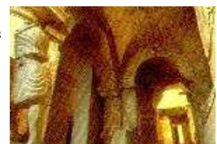
Crypt of the Cathedral

The Museum preserves old and worthy medieval codes, liturgical and musical treasures of Southern Italy written in the typical "beneventana" script, historic manufactured goods and documents coming from the destroyed cathedral or from its treasure are preserved along with the bronze door (dated the end of the XII century), whose tiles represent the Archbishop of Benevento with twenty-four suffragan bishops. The crypt, allegedly dated VIII century, has walls with ancient frescoes representing Bishop Pietro Sagacissimo defending the town against the Byzantine siege.